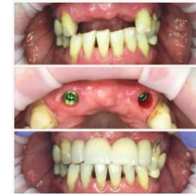
4 missing teeth restored with 2 implants and a 4-unit bridge