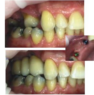
2 implants and a 3-unit bridge on the upper right side of the mouth