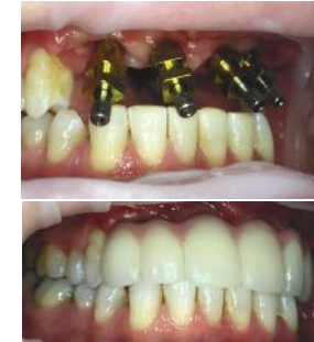
Multiple missing teeth restored with 4 implants and a bridge